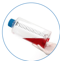
Nunc Polystyrene Roller Bottles