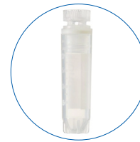
Nunc 2.0mL Internally-Threaded Universal Tubes