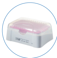
Finnpipette Flex Filtered Pipette Tips