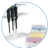
Finnpipette™ F2 GLP Pipetter Kits