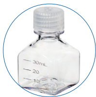
Nalgene LDPE Sample Vials with Closure