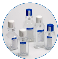
Sterilin Water Sampling Bottles