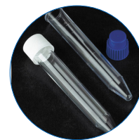
Sterilin™ 13.5mL Centrifuge Tubes