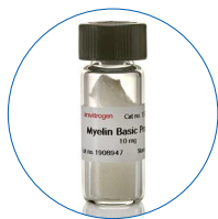
Gibco™ MBP Bovine Protein, Natural