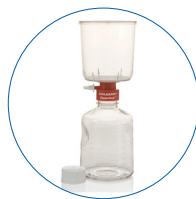
Nalgene Rapid-Flow Sterile Single Use Vacuum Filter Unit