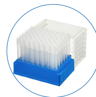
Abgene™ 2D Barcoded Screw Cap Tubes