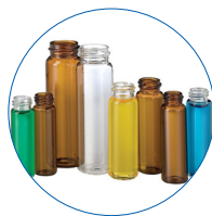
Chromacol™ Storage Vial Kits