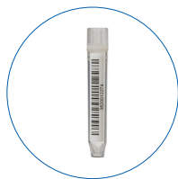
Matrix™ ScrewTop Tubes