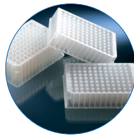
Nunc 96-Well Polypropylene DeepWell Storage Plates